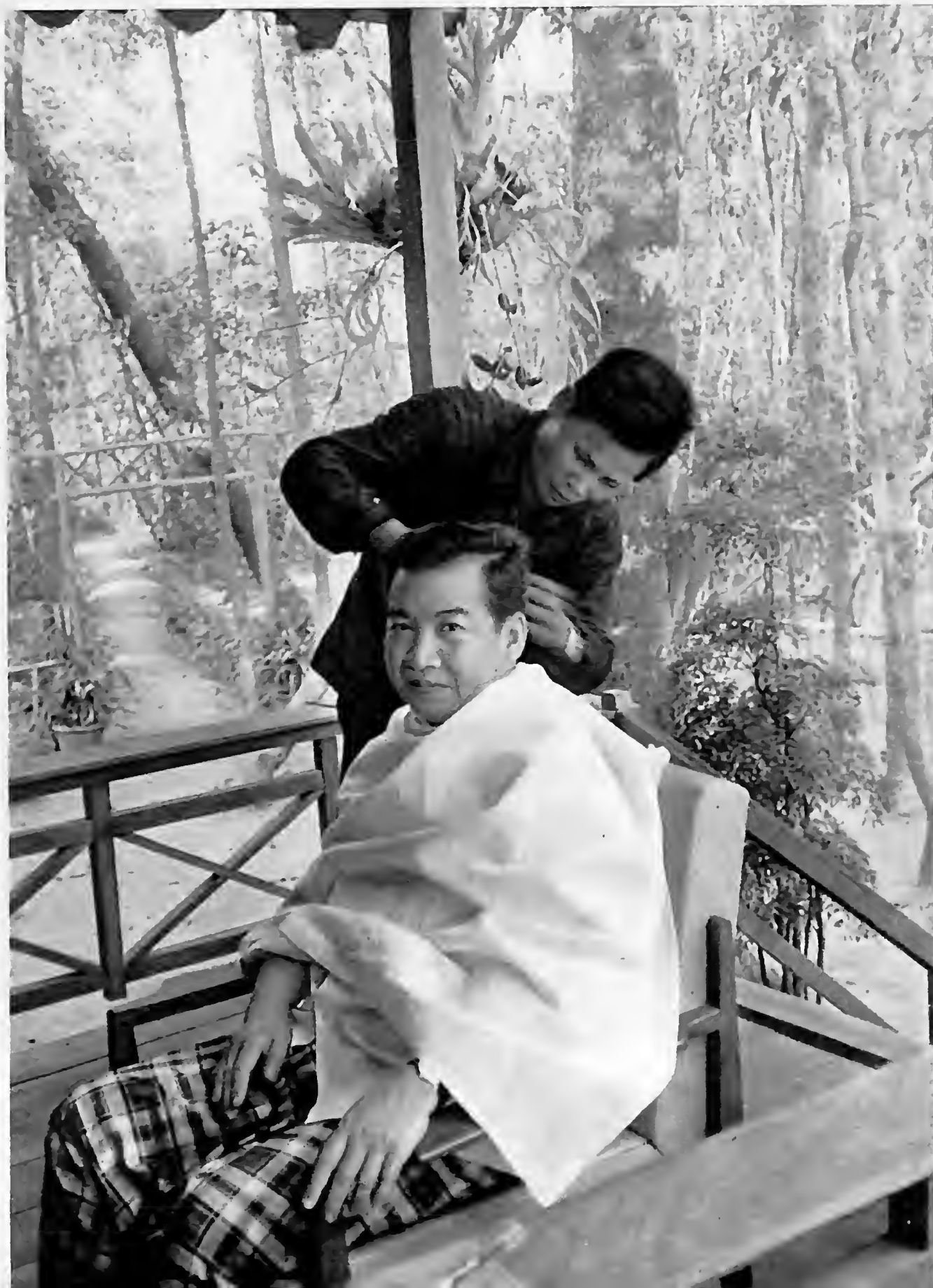
A P.A.F.N.L.C. fighter giving the Samdech a haircut.